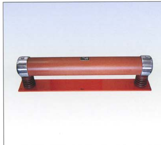
(4) Capacitor discharge resistor

Max Current: 7,500 A Allowable Injection Energy : 4 kJ