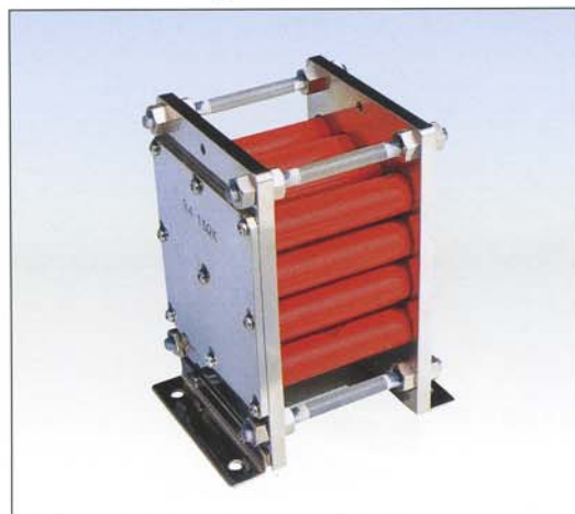
(3) Control and discharge resistor for lightning surge generator Resistor: AS

Resistor: ASU (Three types: \phi 14 , \phi 40 \times \phi 28 , \phi 50 \times \phi 38\text{mm} )