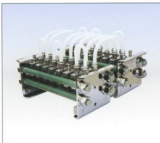
(1) Water cooling resistors for snubber circuit in a large capacity GTO thyristor Resistor: WS-14

EREMA resistors have also been supplied as assemblies manufactured after the requirements of customers. Some exemplary assemblies are shown right: