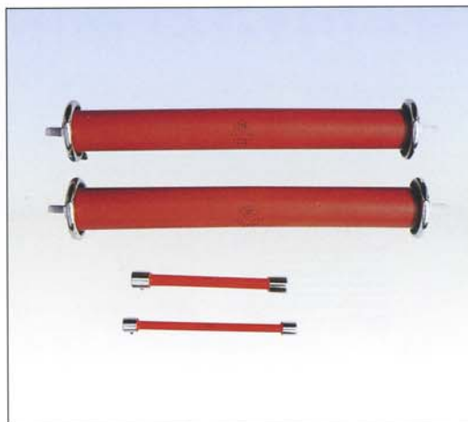
(2) A set of end spark protector

Electric Power: 14 kW (Flow rate: 6 L/min)